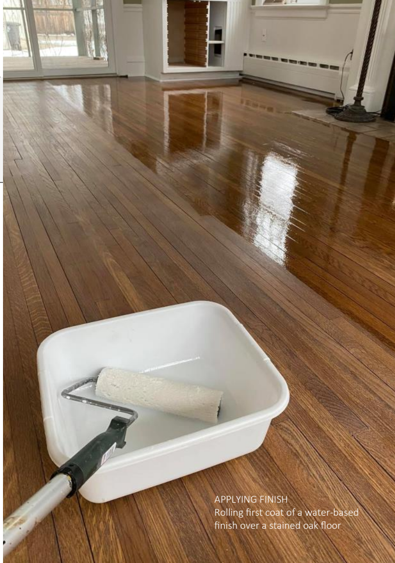
APPLYING FINISH Rolling first coat of a water-based finish over a stained oak floor

When you walk on the floor you are really walking on the finish. As wear occurs on the