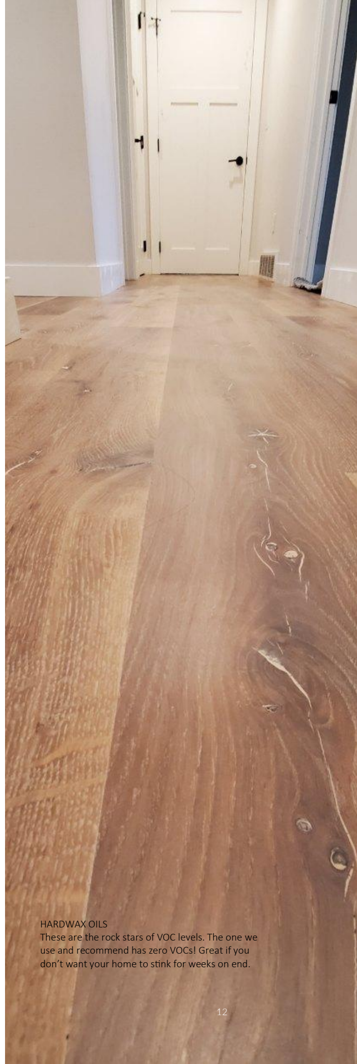
HARDWAX OILS These are the rock stars of VOC levels. The one we use and recommend has zero VOCs! Great if you don't want your home to stink for weeks on end.

If you love super glossy finishes then hardwax oils won't make the cut. The highest gloss level they can attain is a satin sheen, usually with extra steps in the finishing process.